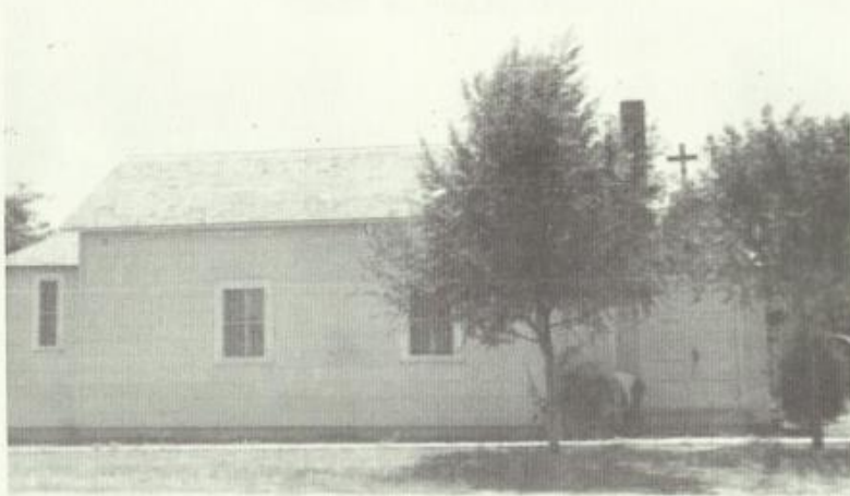
(First church building)

"And she gave birth to her first-born son and wrapped him in swaddling cloths, and laid him in a manger, because there was no place for them in the inn." (Luke 2:7)