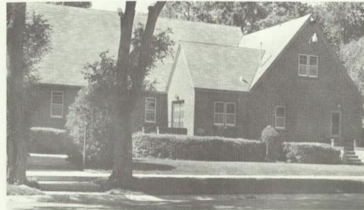
(Present church building)

"And she gave birth to her first-born son and wrapped him in swaddling cloths, and laid him in a manger, because there was no place for them in the inn." (Luke 2:7)