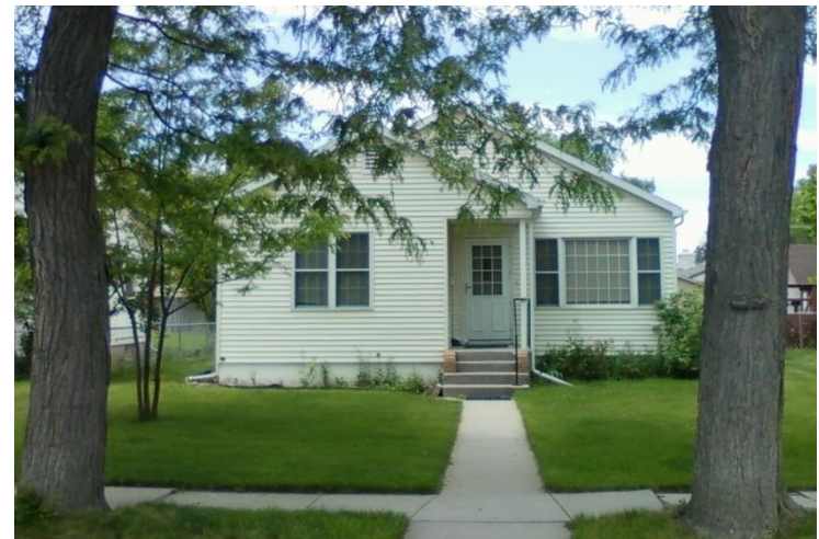
Parsonage (across the street)