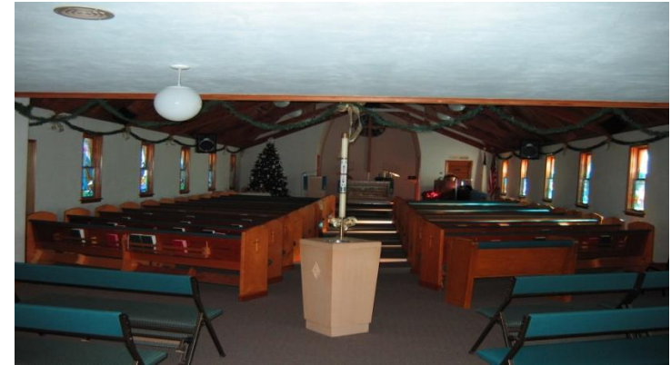
Beautiful stained glass Windows were added In 2010